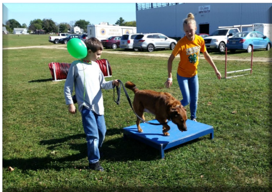
4-H Youth Development