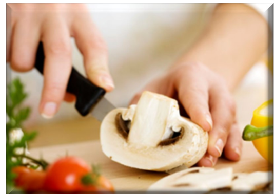
Family Living & Nutrition

Extending the resources and knowledge of the University of Wisconsin to the people of Green County