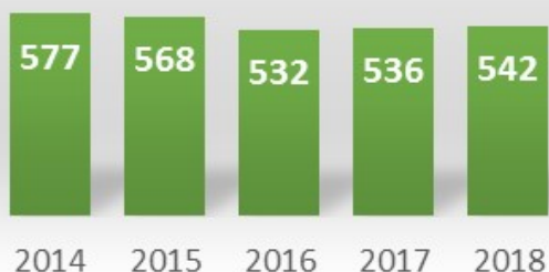
4-H Member Enrollments in the Last 5 Years