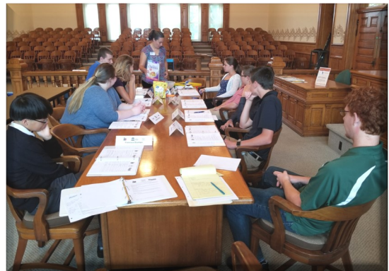
Community, Natural Resources, & Economic Development