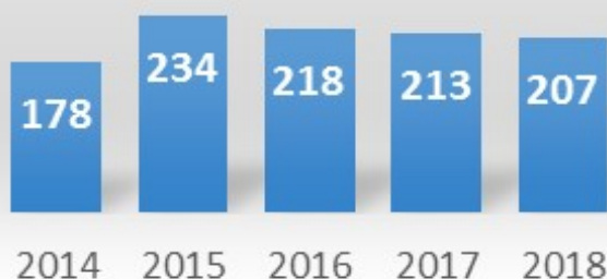
Adult Leader Enrollments in the Last 5 Years

"The liability information was where I feel I learned the most. These are things I don't normally think about and they are always good to have in the back of your mind when making decisions with youth and families."